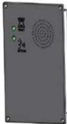
Figure 4 Passenger Intercom (IPEP)