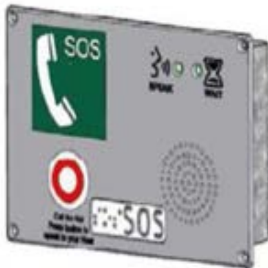
Figure 3 PRM Intercom (IPEP PMR)