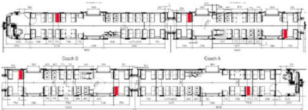
Fig. 60 Fire extinguisher layout

Help points which connect passengers to the driver are located throughout the train, including specifically in the areas designed for wheelchair users. Their locations are shown below.