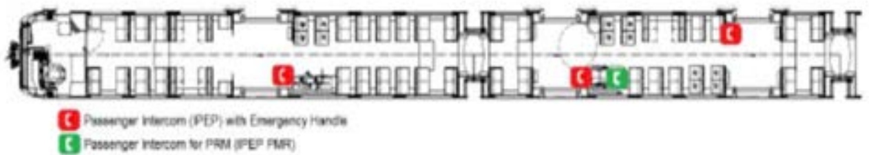
Figure 2 Passenger emergency intercom distribution

Help points which connect passengers to the driver are located throughout the train, including specifically in the areas designed for wheelchair users. Their locations are shown below.