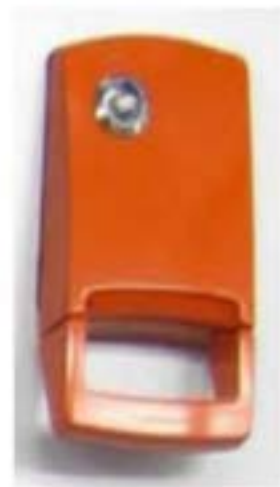
Figure 5 Emergency handle