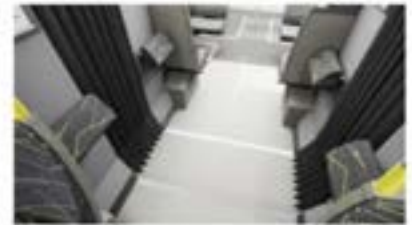
Fig. 36 Gangways / Vestibules / Wheelchair areas / Bicycle areas /